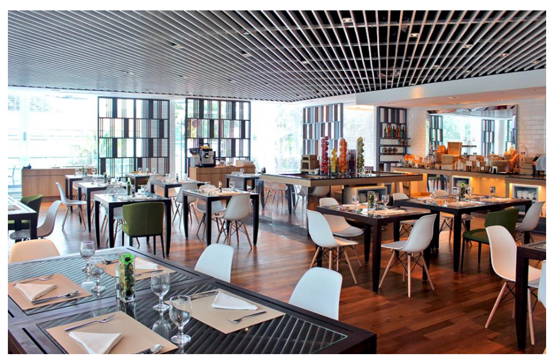
With its new, modern and inviting interiors, the Shutters restaurant will also serve a greater variety of contemporary Asian and Western signatures.

More spaces to encourage social networking will include the extended Tier Bar that offers idyllic alfresco setting, a new lounge and the newly renovated rooftop infinity pool with increased seating capacity to allow for relaxing poolside conversation against breathtaking views of the South China Sea.